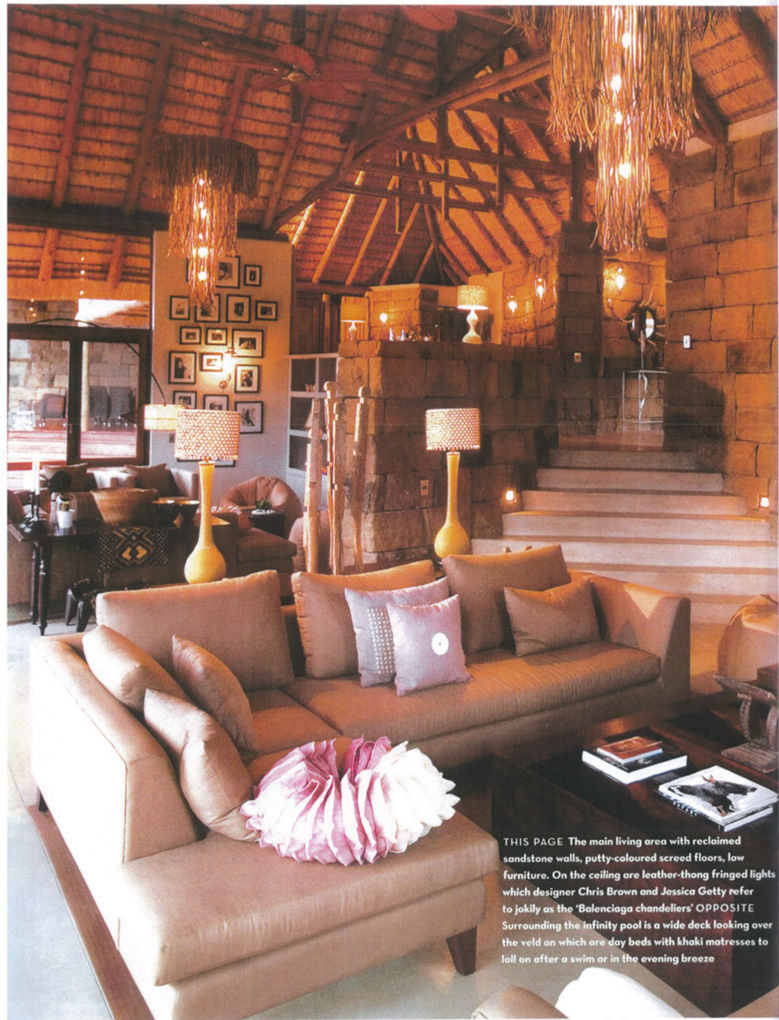
THIS PAGE The main living area with reclaimed sandstone walls, putty-coloured screed floors, low furniture. On the ceiling are leather-thong fringed lights which designer Chris Brown and Jessica Getty refer to jocularly as the 'Balenciaga chandeliers' OPPOSITE Surrounding the infinity pool is a wide deck looking over the veld on which are day beds with khaki mattresses to loll on after a swim or in the evening breeze